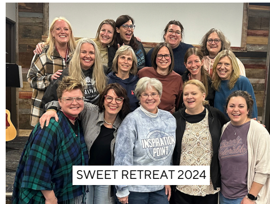
SWEET RETREAT 2024