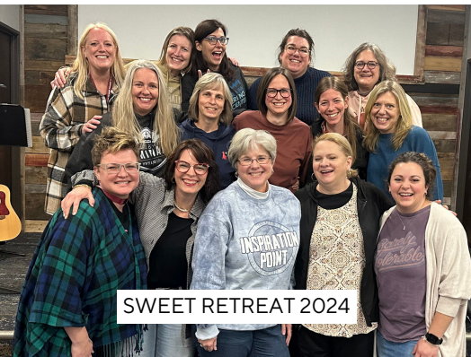
SWEET RETREAT 2024

“May the Lord make your love increase and overflow for each other and for everyone else, just as ours does for you.” (1 Thess. 3:12)